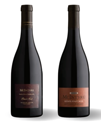
Tasting Studio Exclusive

The Estate Chardonnay and Pinot Noir are sourced from the family's 80-acre McIntyre Estate Vineyard in the heart of the Santa Lucia Highlands. This picturesque sloping site, located in the afternoon shadows of the Santa Lucia Mountains, is farmed meticulously and sustainably to ensure low yields and small berries. These wines are concentrated, precise, sophisticated and compelling.